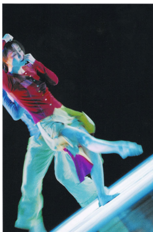
Dance Company THE BODY